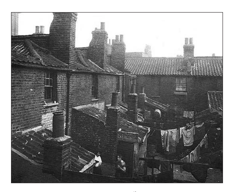
[Housing in the 19<sup>th</sup> century]