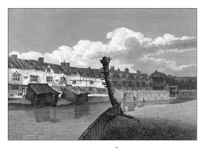
[Housing in the 17<sup>th</sup> century]