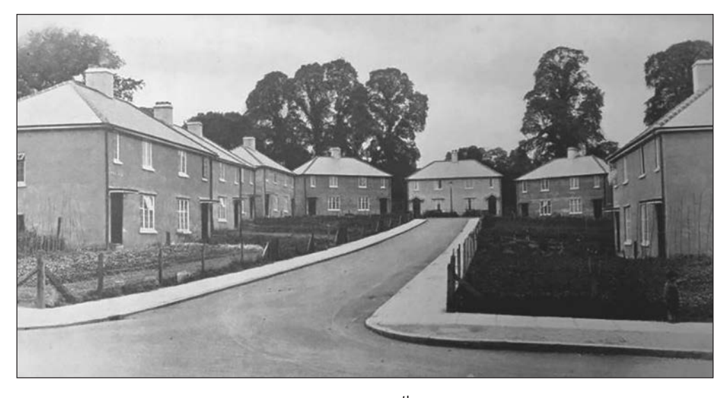
[Housing in the 20<sup>th</sup> century]